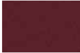
Regency Red Mica