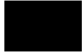
Midnight Black Mica