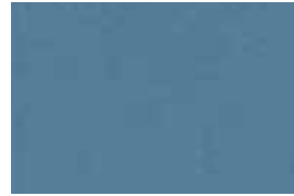
Glacier Blue Metallic