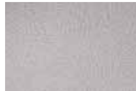
Grey Leather (TS)

Colour availability varies by grade and KMUK stock levels, so please contact your Kia dealer for details of colour availability across the Sedona range.