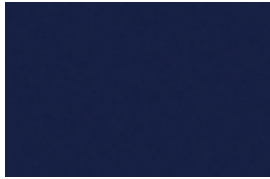
Velvet Indigo Blue Metallic